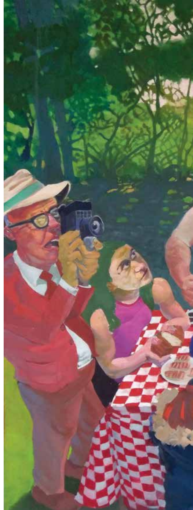
Souvla and Meze with Uncles (2018) oil on canvas 150x200