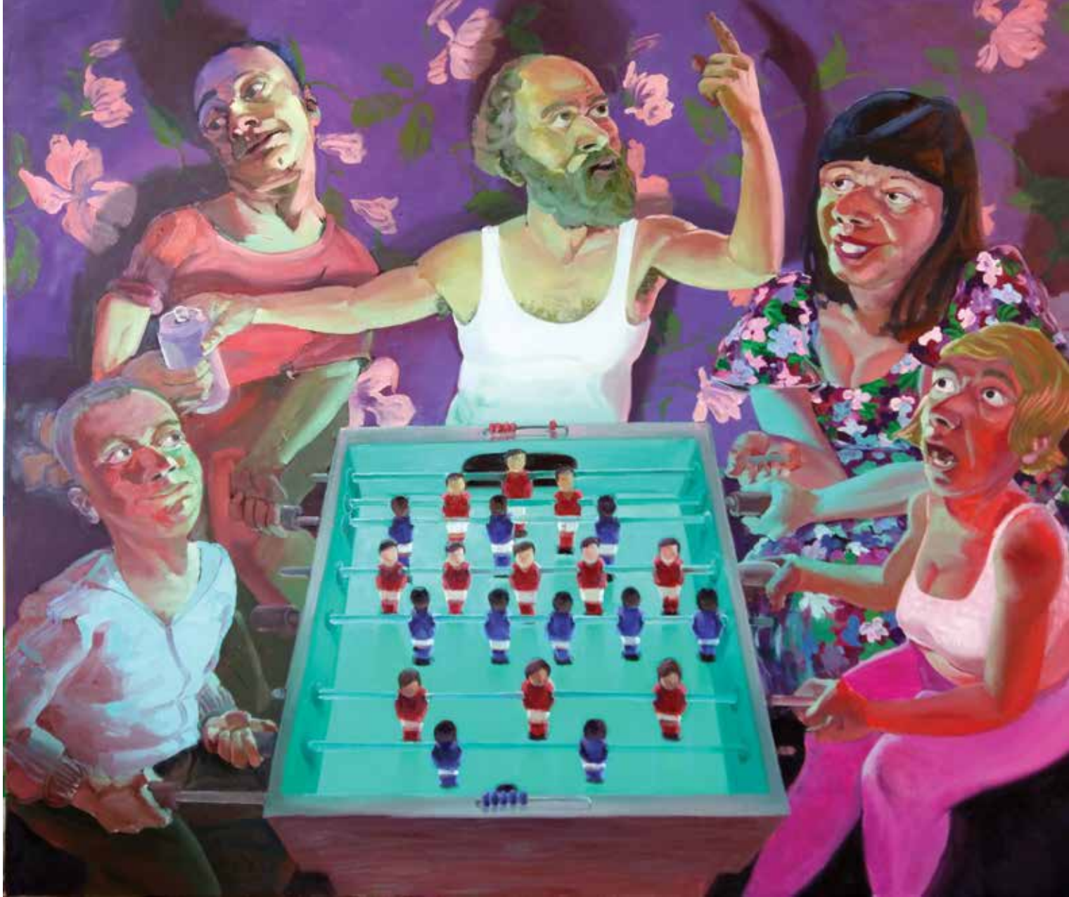
The Socratic Method (2018) oil on canvas 125x148