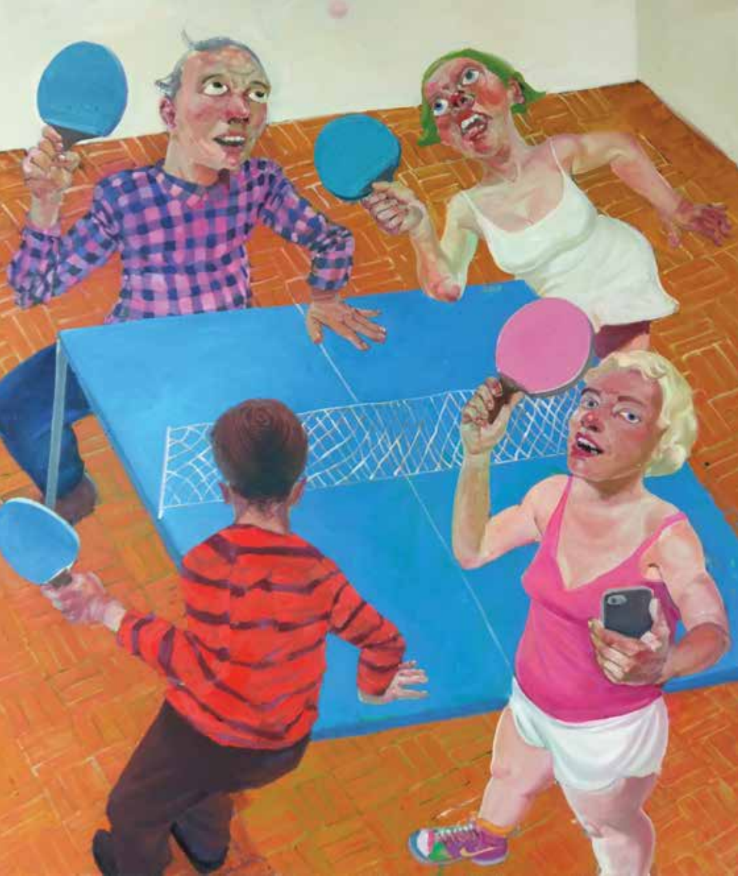
Ping Pong Selfie (2018)