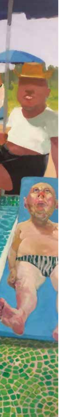
Sunburn (2018) oil on canvas 160x180