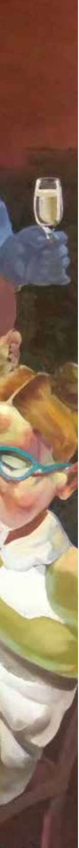
The Gamblers (2019) oil on canvas 135x148