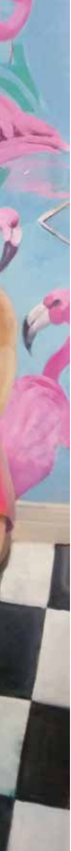
The Philosophers' Nail Bar (2018) oil on canvas 125x130