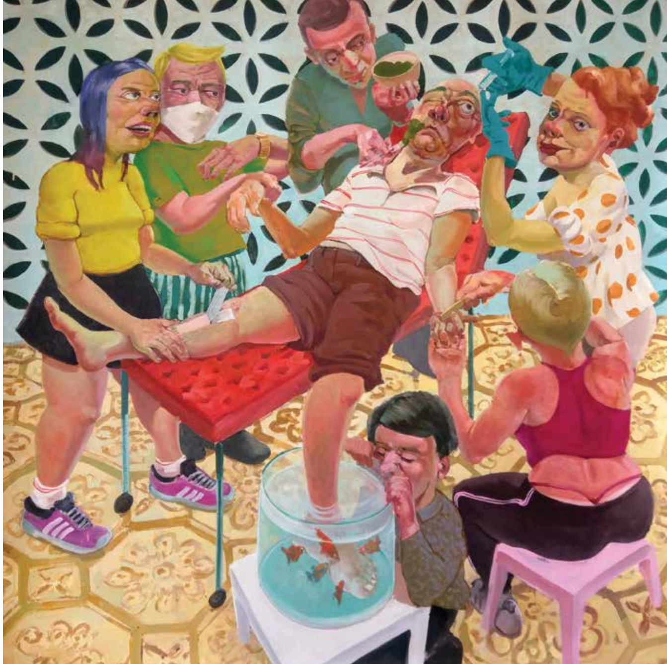
The Hedonic Calculus of Health and Beauty (2019)