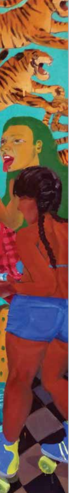
The Tiger Lounge (2018) oil on canvas 160x180