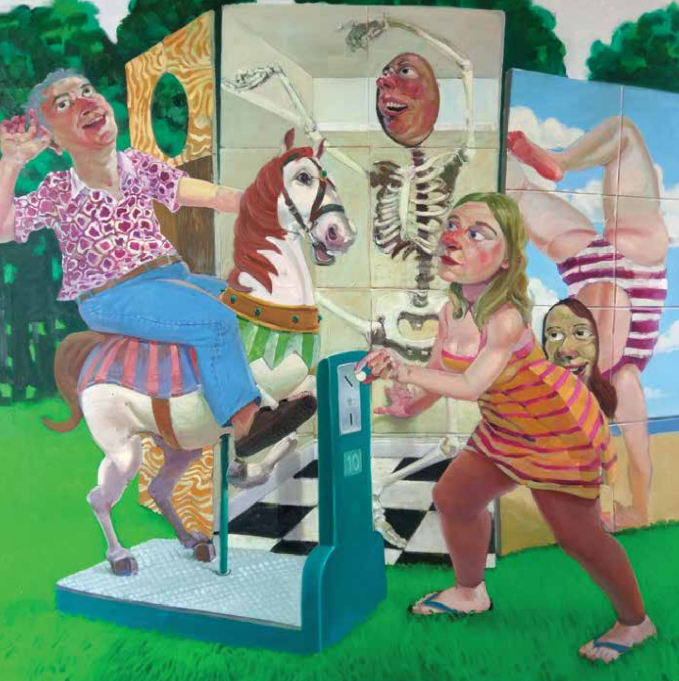
Father's Day (2018)