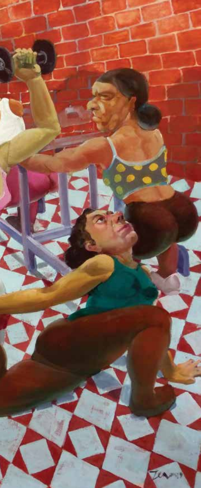
The Panopticon Gymnasium (2019) oil on canvas 130x180